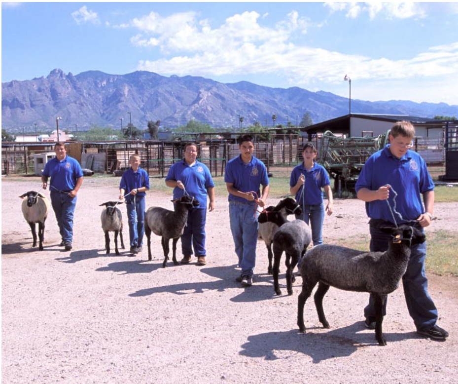
FFA students from Amphitheater High School, Tucson, Arizona, leading their sheep.