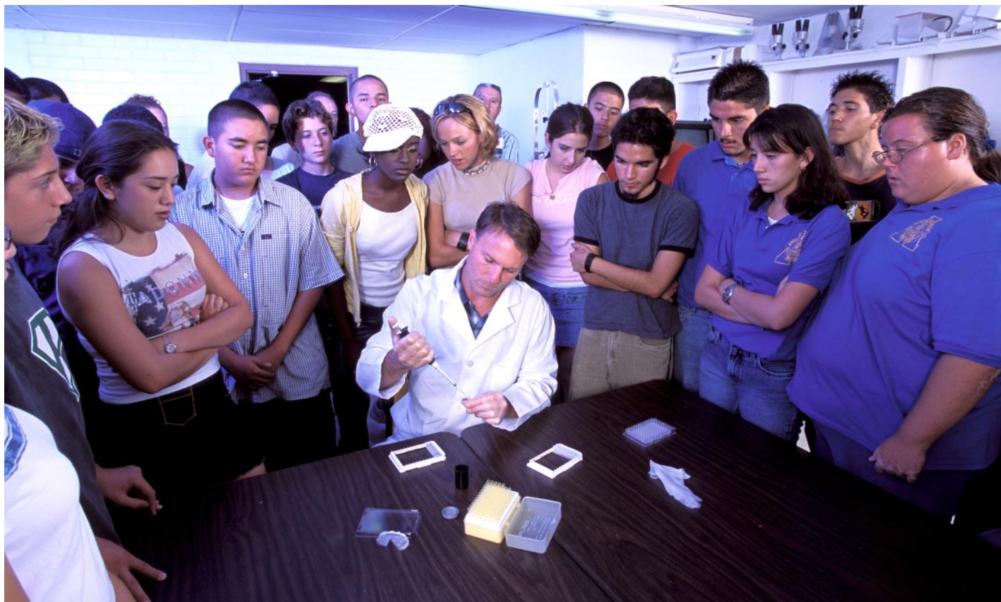
Ag Ed students watching a veterinarian perform a test.

Some educators have reservations about IBL. They are concerned that IBL takes too much time and effort making it less efficient than other methods. The teacher knows what the students need to know and has the responsibility to relay this information to students. IBL places too much responsibility on students who are not ready to become independent learners. Educators are concerned that students will