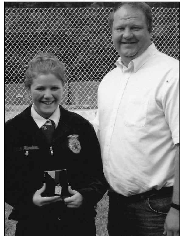
The FFA also provides numerous rewards for students who excel in the development of their leadership skills.