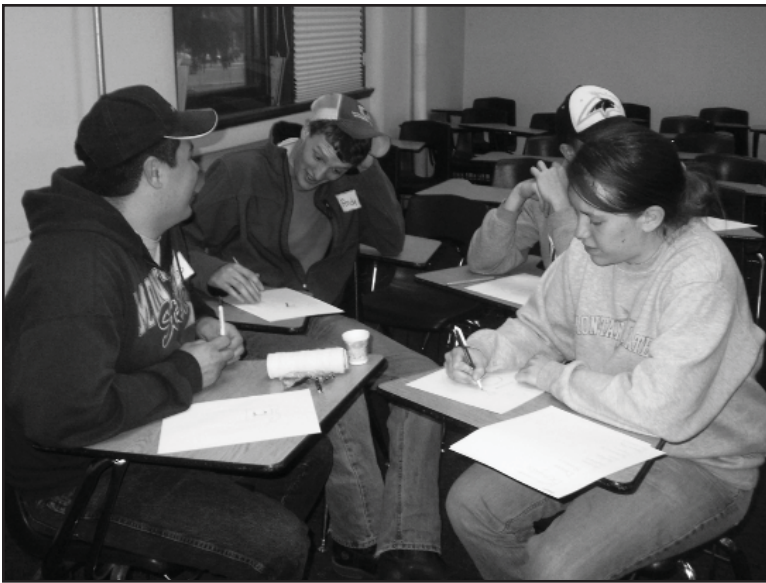
Montana State University College of Agriculture Ambassadors practicing written communication skills.

was woodworking and he was asked to build gifts and displays from wood for club activities, he sprung to life organizing groups of people to assist him. In addition, he became more active in club discussions after having the opportunity to utilize his talents for the group.