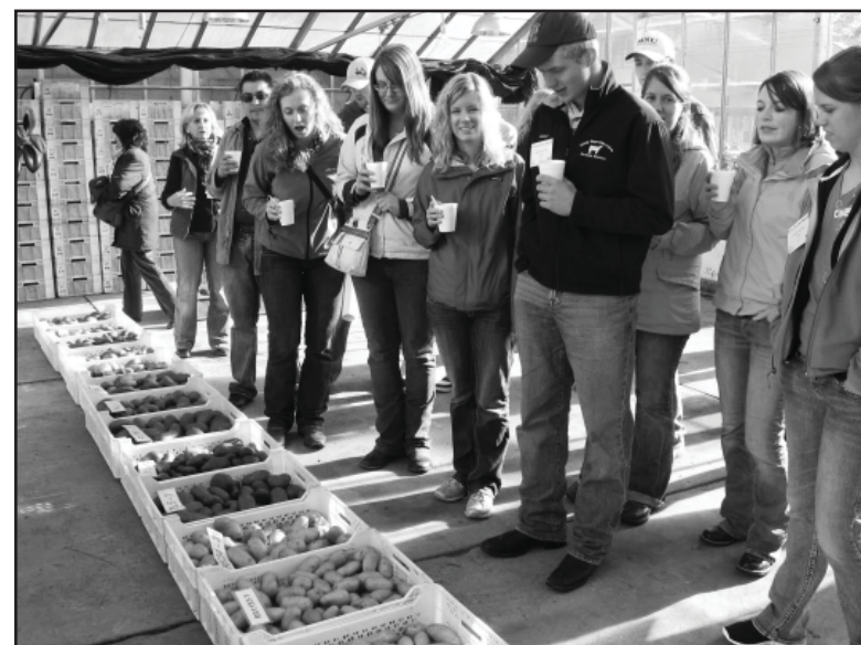
Montana State University's 2010 "Follow the Grain" class learns about new potato varieties at the Chilean government's potato research facility in southern Chile.

6. Crisis Management: Crisis management is the ultimate test of an agricultural education student's leadership abilities. As a teacher and student organization advisor, students frequently come to you for crisis solutions.