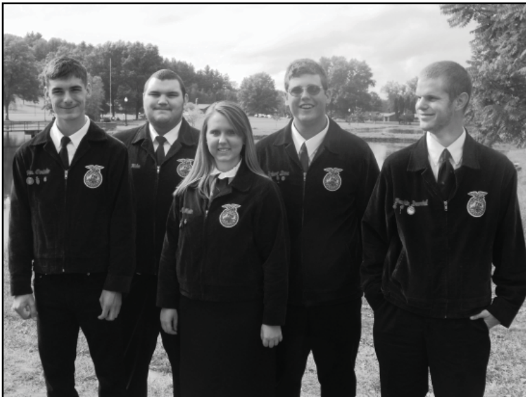
The FFA provides many opportunities for students to develop leadership skills.