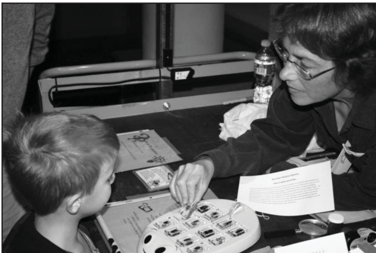
Montana State University Student teaching youth about insects at a service learning program