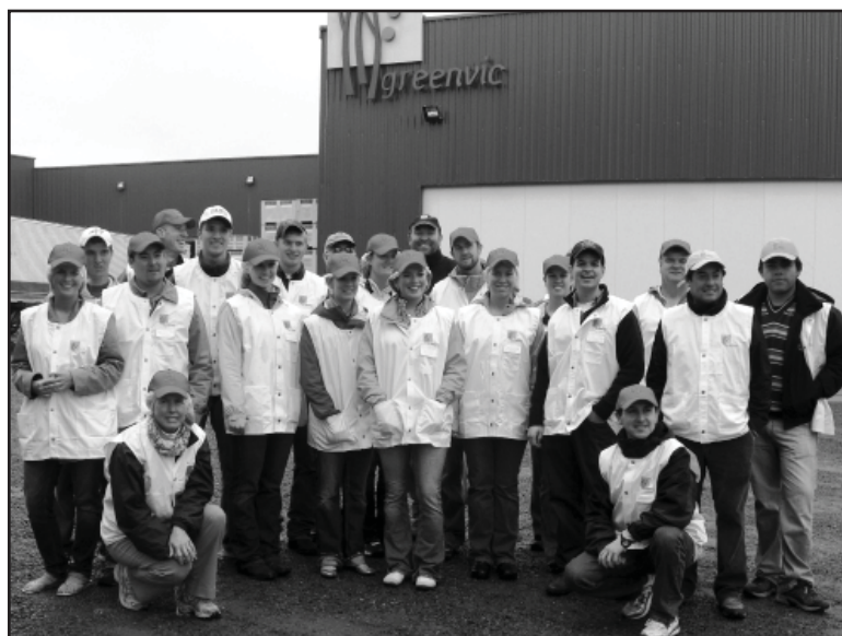
Montana State University's 2010 "Follow the Grain" Class touring Grenvic's fruit packing facility outside of Santiago, Chile.

Instead of telling them how to resolve their crisis, give them three possible solutions and let them make the ultimate decision. It is important to not take over when a crisis arises, as experience is the only