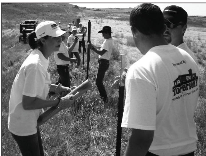
The Montana Ag Opportunities tour members performing community service at the new “Farm in the Dell,” a place for the developmentally disabled to live and receive and have a higher quality of life.