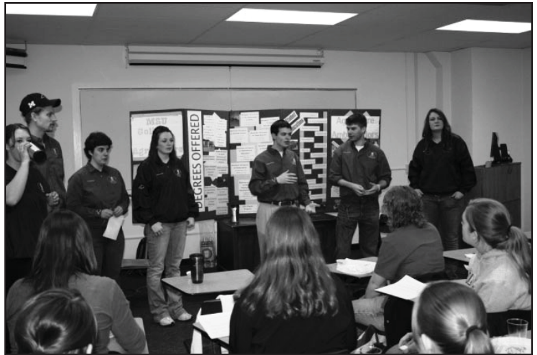
Montana State University College of Ambassadors Recruitment Youth Event

In-school or out-of-school, agriculture students are learning to become future leaders of the next generation. Each student develops in different ways and through unique experiences that are provided by those that advise, teach, and mentor them. How can you “Make the best better” and “Make a positive difference in the lives of students by developing their potential for premier leadership, personal growth and career success through agricultural edu-