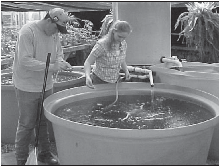
Agricultural education programs incorporate numerous non-traditional areas of study. Students from Cabell Midland High School (WV) maintaining their aquaculture project.

mindset that is held by this new generation is one that seems to have permeated all facets of socioeconomic status, demography, race and gender. Due in part to unprecedented access to the Internet and changing nature of television, today's young people are exposed to situations and thought processes that normally wouldn't introduce themselves until later (sometimes much later) in their lives. The exposure to this information creates an artificial sense of intelligence and false sense of wisdom among young people. Superimpose this paradigm shift into the classroom and we begin to see the real challenge that teachers are facing with regard to the non-traditional student.