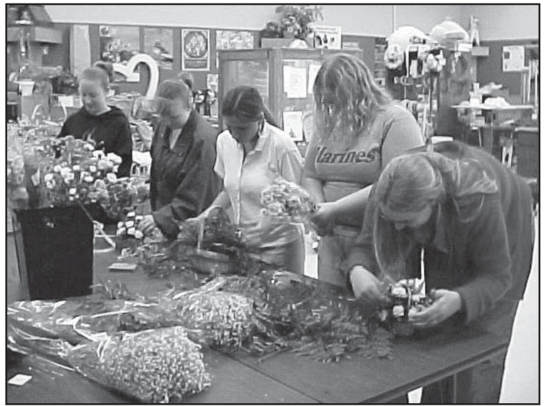
Today's agricultural education programs are filled with opportunities to "apply" knowledge and skills in hands-on applications. Students from Cabell Midland High School (WV) applying their skills in floral design.

As a future teacher of agriculture, I hope to aid students in their journeys through high school and better prepare them for life. I also hope to expose students to the rich