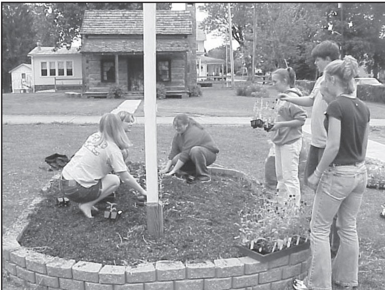
Agricultural education programs often include the opportunity for students to use their knowledge and skills in community service activities. Students from Tyler Consolidated High School (WV) working on a landscaping project.

Even with the societal changes that our students have embraced, I do believe that they are the future leaders in the agriculture industry. Students today, just as I did, will rise to the expectations their teachers set before them. It is up to the students' role models, who often are their teachers, to show them how to learn and educate others about the agriculture industry, effectively utilize technology, develop a work ethic that will enable them to succeed in their careers, and to embrace a passion to serve and help those around them. As we continue to work with an ever-changing generation, consider this quote by Huston Smith, "The most powerful moral influence is example."