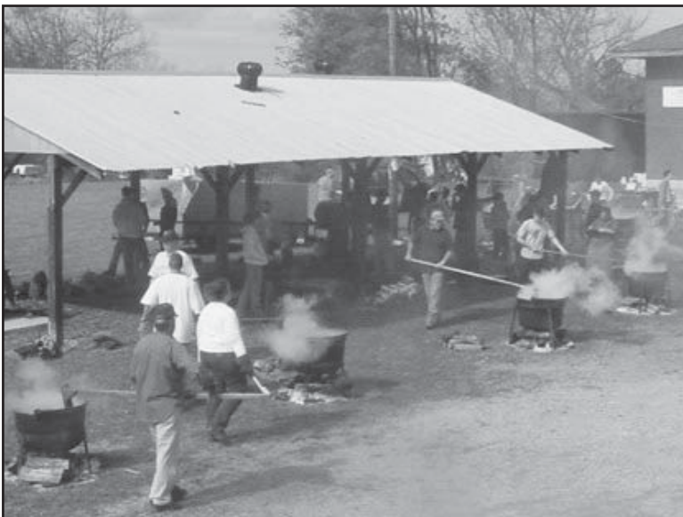
Combining tradition and non-traditional activities: Jefferson High FFA (WV) members preparing apple butter as a part of a fund raising activity.

After high school graduation in 1998, I went to Iowa State University, the land grant institution, majoring in journalism and mass communications. I was the only one of my classmates who went to Iowa State directly from high school. All of my friends were in the College of Agriculture. By November, I was an Agricultural Education major. I went to Agricultural Education because of FFA.