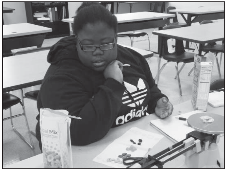
A student preparing an Agriscience Fair project.

Utilizing the agriscience fair as a method of assessing student learning allows instructors to assess standards, increase participation in FFA activi-