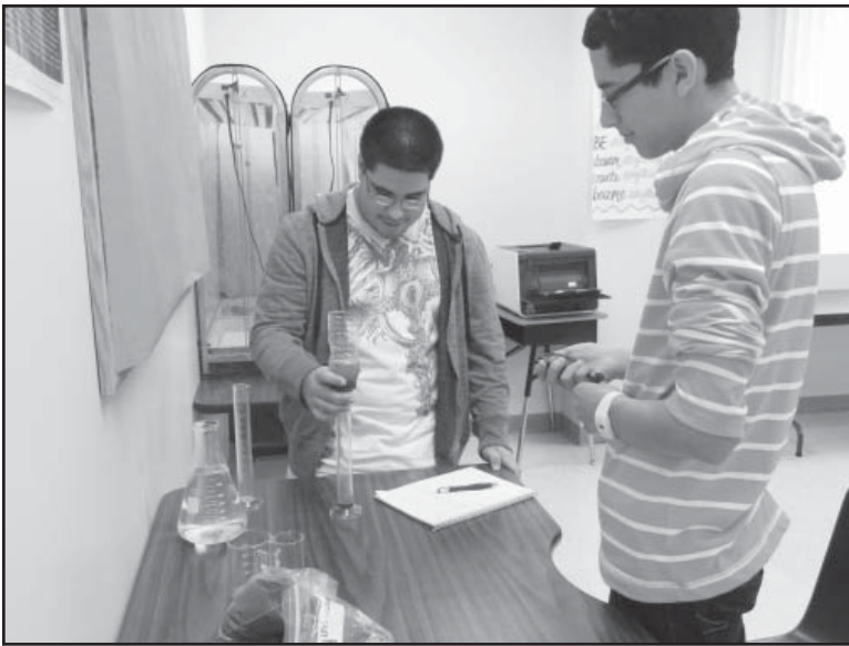
Agriscience Fair projects require the development of precise measurement skills.

analysis of science and technical texts, attending to the precise details of explanations or descriptions, 2) translate quantitative or technical information expressed in words in a text into visual form (e.g., a table or chart) and translate information expressed visually or mathematically (e.g., in an equation) into words, 3) write precise enough descriptions of the step-by-step procedures they use in their investigations or technical work that others can replicate them and (possibly) reach the same results, and 4) develop and strengthen writing as needed by planning, revising, editing, rewriting, or trying a new approach, focusing on addressing what is most significant for a specific purpose and audience, all of which are just a few examples of the standards that align with utilizing agriscience fair research projects within your curriculum.