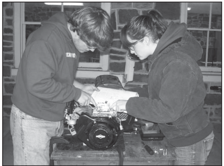
Inquiry in Mechanics: learner engages in question and gives priority to evidence in response to question.

IBI formative assessment is unique because student progress is evaluated, but from the learner themselves rather than the teacher. Most formative assessment affords the teachers insight to where the learner is and what the plan of action is to assure success for the learner. As discussed earlier through the five features, learner, learner, learner, learner, learner, formative assessment is no exception. A classroom that utilizes IBI allows the learner to develop the ability to check their own progress by engaging in questions, giving priority to evidence, formulating an explanation, connecting, communicating and providing a justification. Please don't misunderstand me; we as teacher are still accountable to the assessment of our learners. Academic rigor is heightened when the learner facilitates the assessment first through investigation, with the teacher provid-