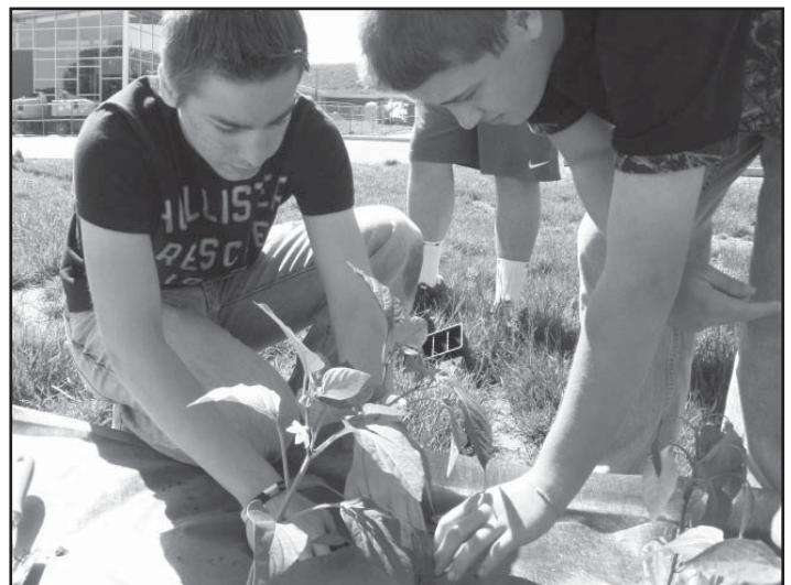
Assessment strategies include the measurement of student skills.