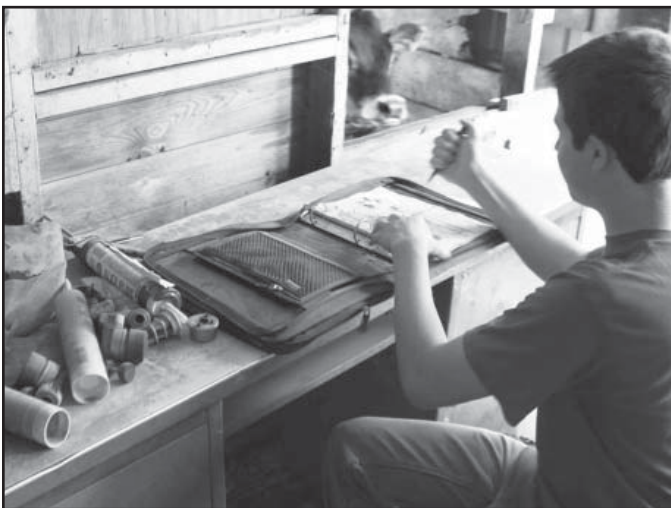
SAE records become a vital part of an assessment strategy for agricultural education programs.

In sum, accountability and assessment can be something we are troubled by in education. Learning how to effectively showcase the measures and using tools that are unique to SBAE can bring our programs into the full discussion as agriculture being the true integrated science, the best way to bring all components of STEM accountability measures to the forefront of the school's assessments and accountability plan. Start this school year strong and look for way to incorporate what the authors share in this issue.